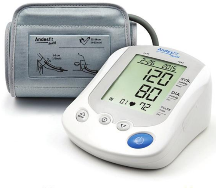
Standard Package: Monitor, 4AA Batteries, and Cuff